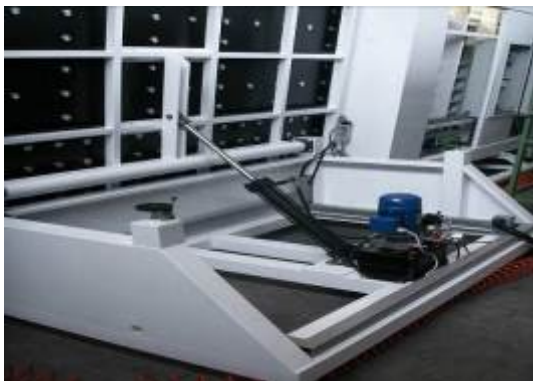
Optional hydraulic tilting table system